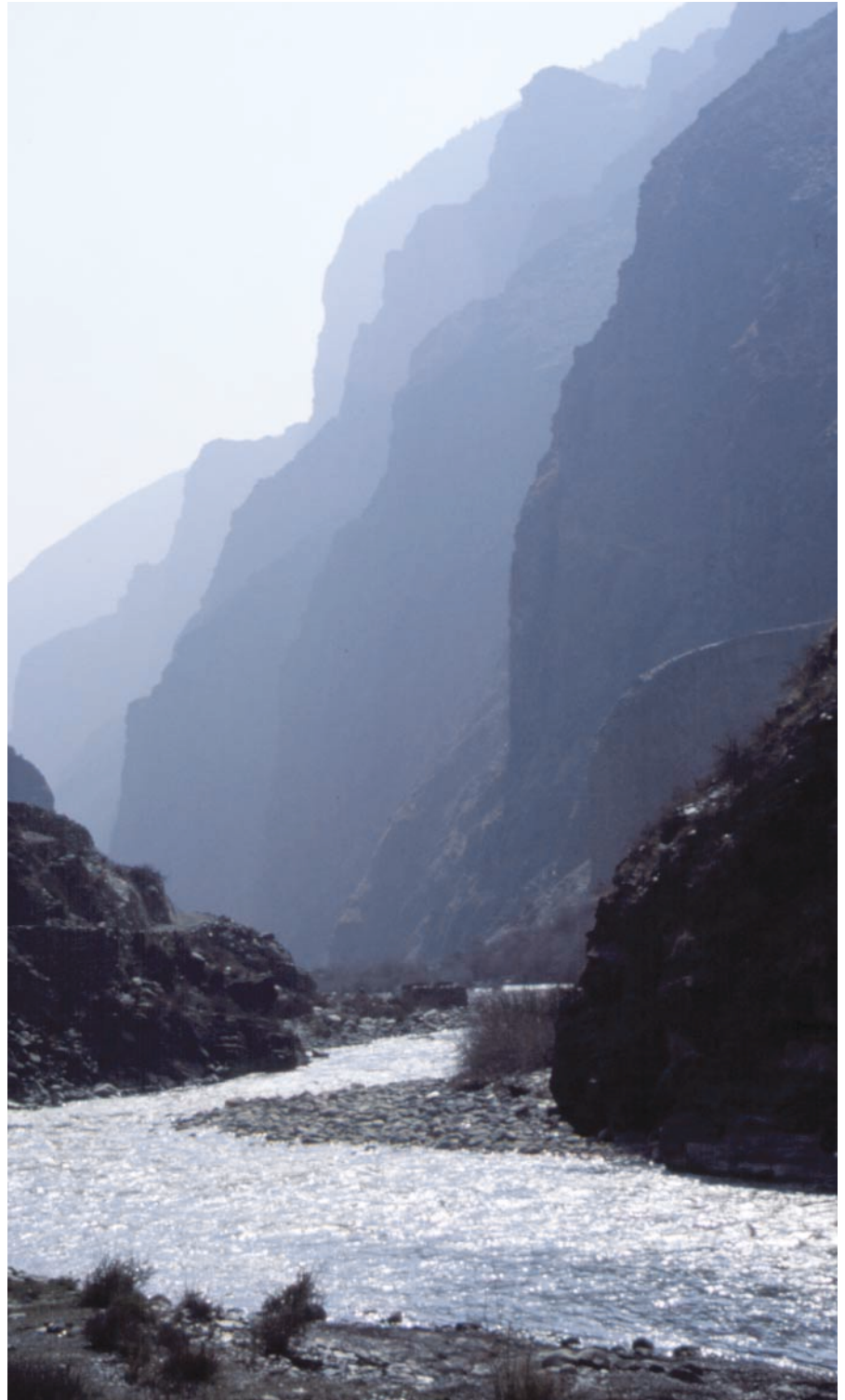
Figure 1 Blue yonder. Steep hillslopes in the rapidly eroding Himalaya north of the newly defined fault 6 and the ‘physiographic transition’.